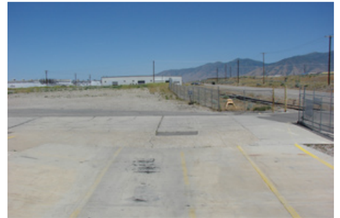
Paved 8 Acre Yard

COMMERCE CRG 175 East 400 South, Suite 700 Salt Lake City, Utah 84111 Tel 801-322-2000 www.commercecrg.com