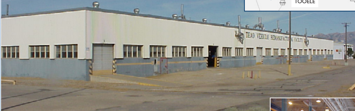
Heavy Equipment Repair Facility