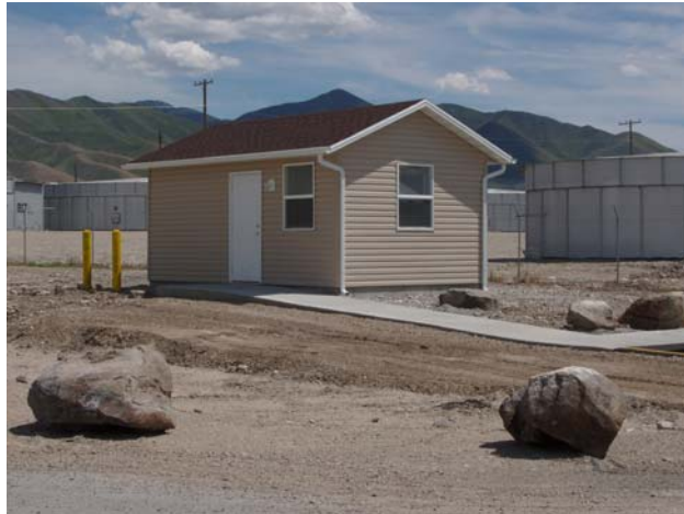
Depot Self Storage 1685 West James Way Tooele, UT 84074 (435) 843-4467

Effective June 15, 2005, management of our storage units will be administered by Cutting Edge Self Storage Management. With over 20 years of experience in the self-storage industry, the company will have an on-site office to serve you. The new Depot Self Storage office has been constructed at 1685 West James Way, at the west entrance gate to the storage units. Please direct all payments and written correspondence to this address. Operating hours are Monday—Friday, 9:00 a.m. to 5:00 p.m. You may telephone the office directly with any inquiries at 435-843-4467.